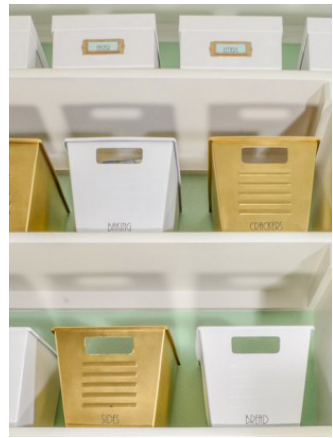
Watch for the "6 for $10 sale" on photo boxes at Michael's. At $1.67 each, they are cheap, versatile, and look great!

They are perfect for extra toiletries in <u>our</u> bathroom.