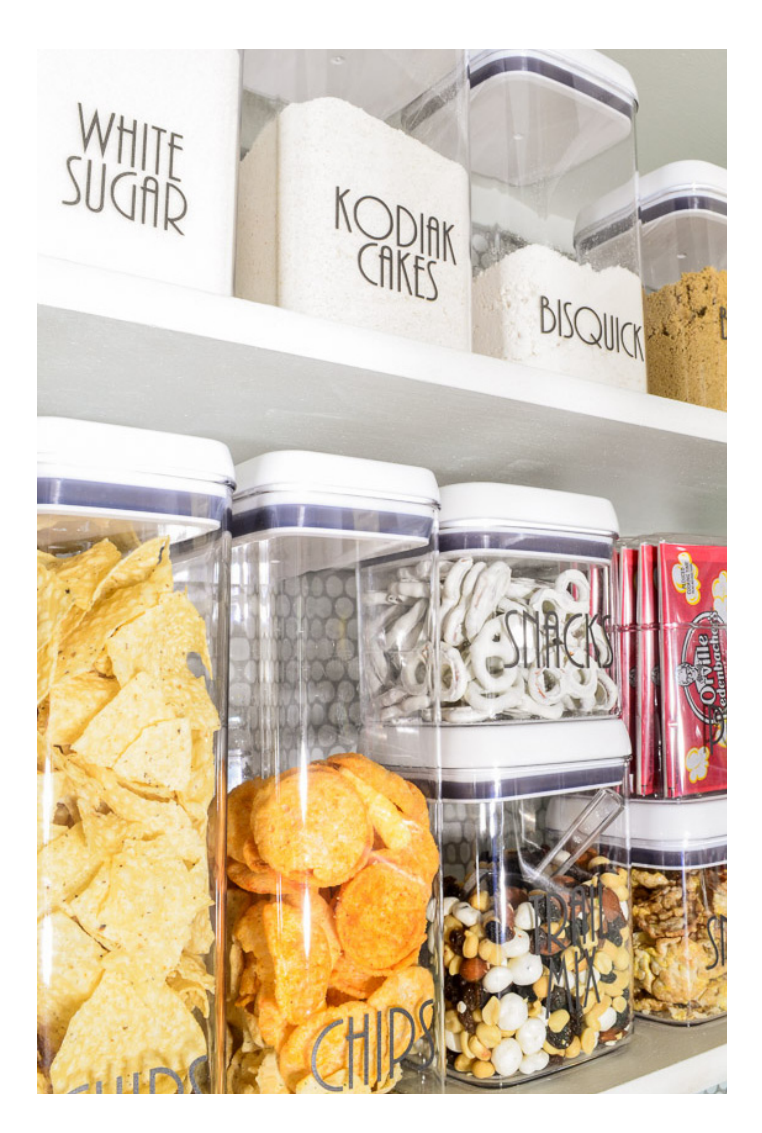
I put off buying pantry canisters for years, but the Flip-Tite containers from WalMart have turned out to be well worth the money.